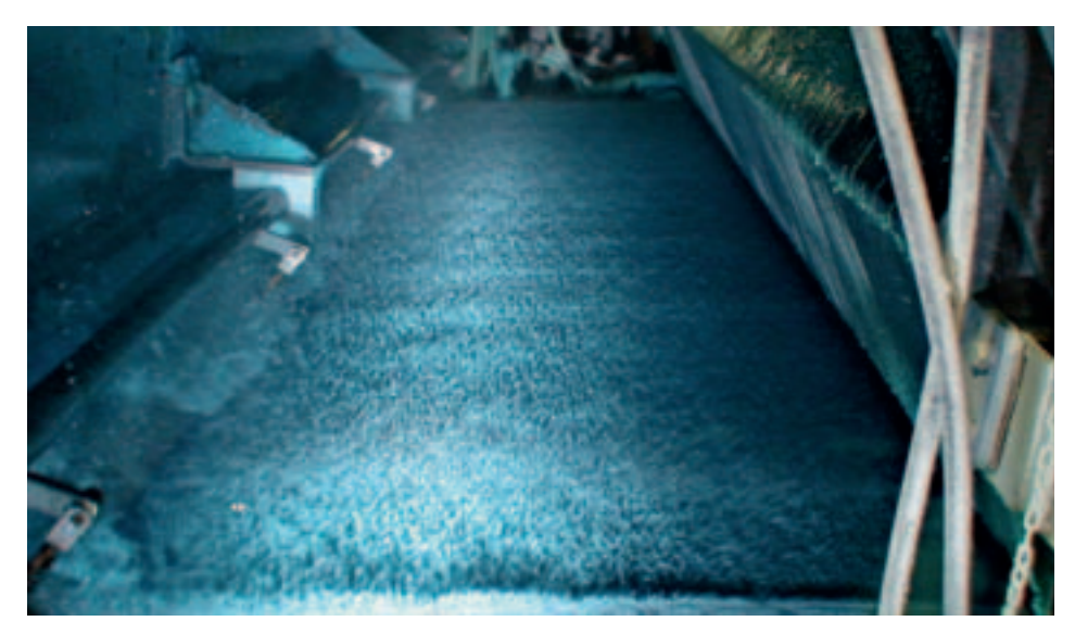
Fig. 1: A spot-pattern strobe light such as the Unilux Beacon provides enough light in the center area of the wire to monitor high-pressure jet sprays. Clear nozzles are required to produce a spray that will clean the wire after a production run and prevent contamination, which can result in defective product, on future runs

As more and more mills get their first look at