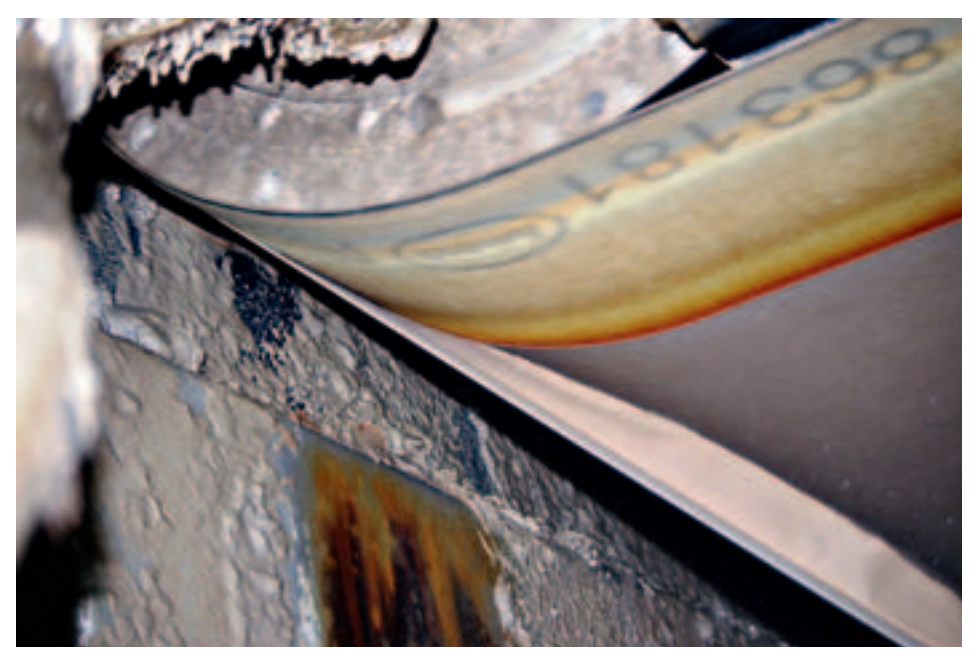
Fig. 3: This is the result of a properly functioning trim jet

zles can cost a lot of money because of more frequent changes of forming fabrics, decreased production, or the need to give commercial discounts to the mill's customers or printers because the paper did not meet standard quality specifications.