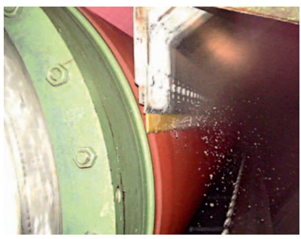
Fig. 4: The spot-pattern light from the Unilux Beacon shows the dewatering at a press roll

Although often placed in full light, the trimming systems and jet require careful setting of the angle, jet, distance and position. Without a strong stroboscope, this delicate setting is nearly impossible. Very often, papermakers underestimate the amount of breaks due to bad trimming. But when a mill has the proper tool to fix this in everyday operation, it can save substantial amounts of money. A strong spot-